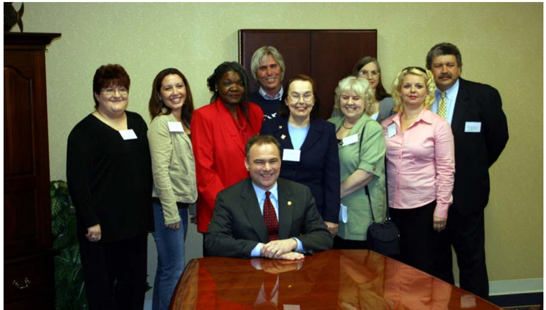
Governor Kaine meets with spouses and parents of deployed Virginia Guardsmen from the 654th Military Police Company. The meeting took place just prior to the Governor's town meeting in Chesapeake, VA on March 29, 2006. Governor Kaine had met the soldiers of these families while visiting Iraq and placed personal telephone calls to families of all soldiers he met.